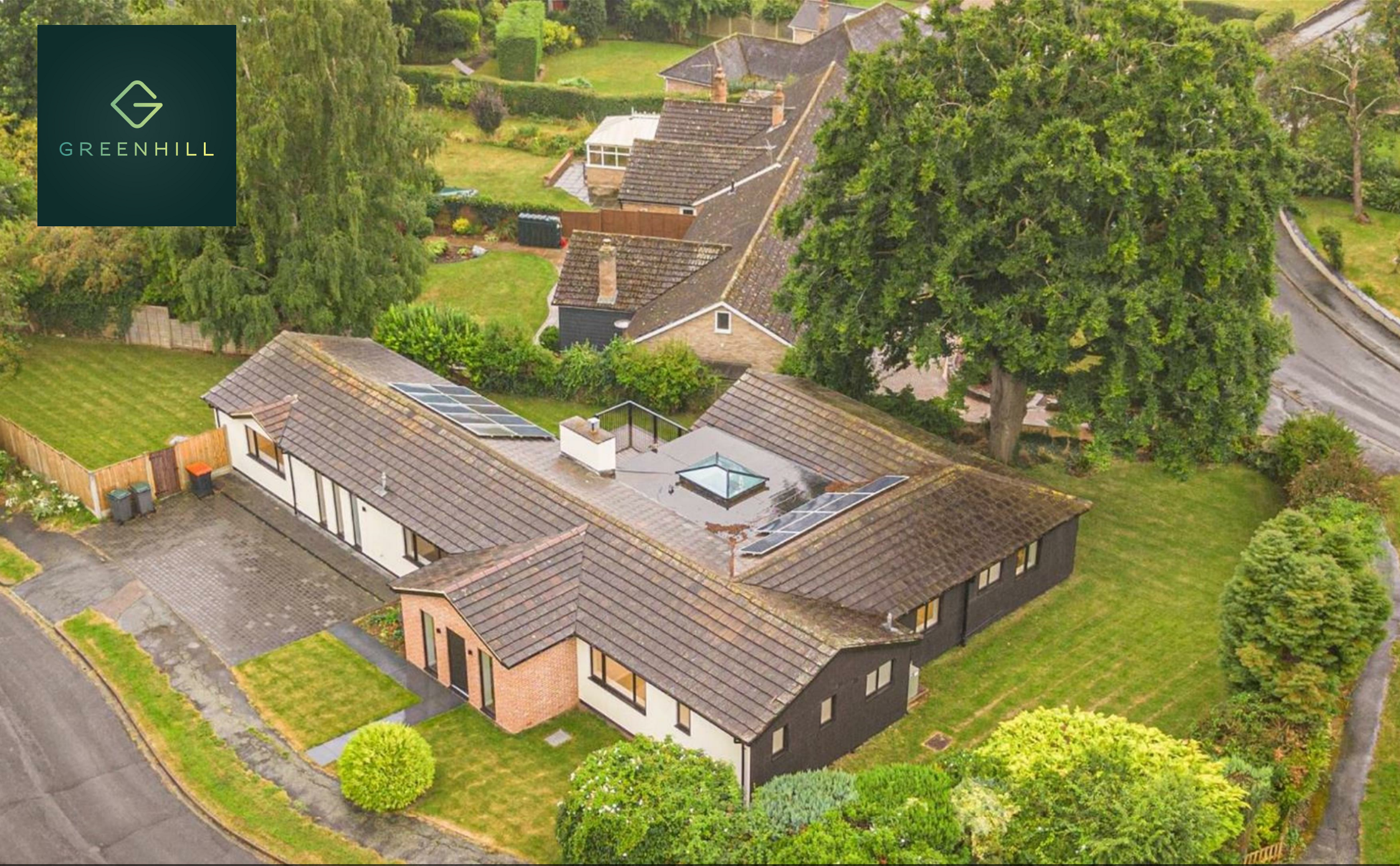
31A The Bury , Pavenham, MK43 7PY Offers in excess of £775,000